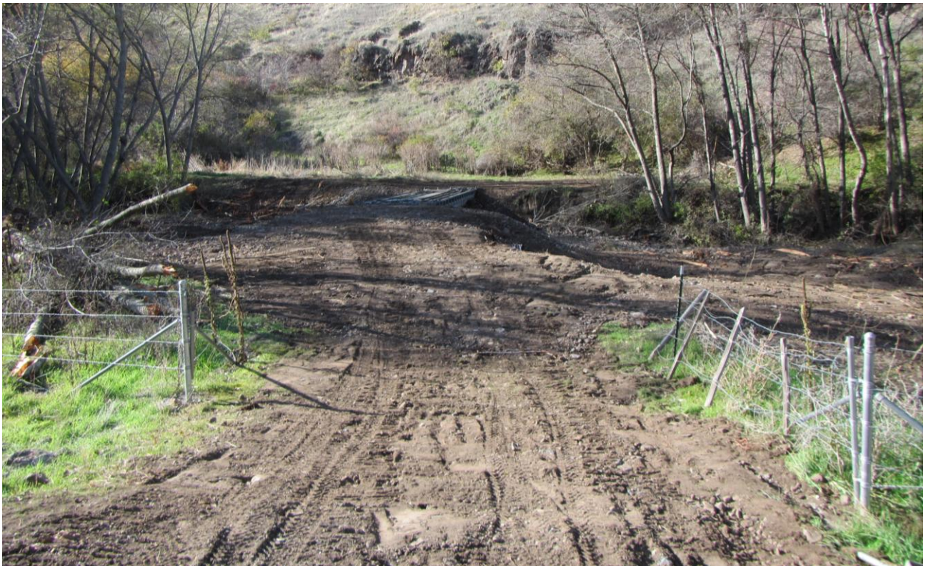
After bridge is set