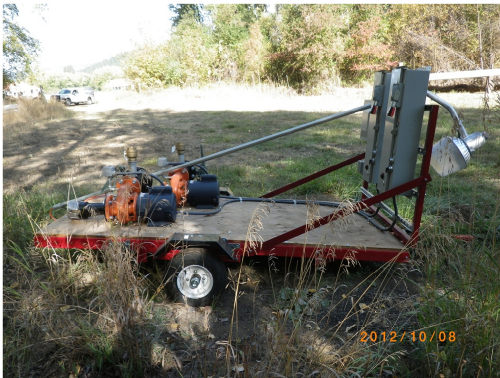
Movable pumps on trailer.