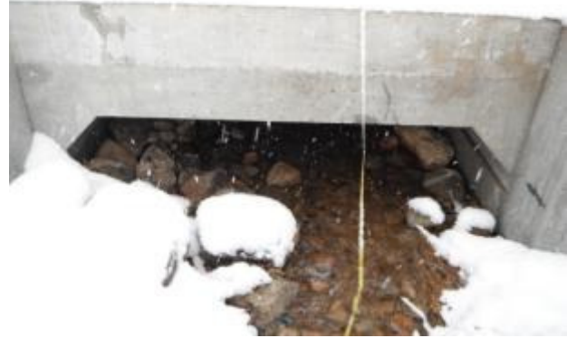
Post Installation: Looking Downstream at Inlet