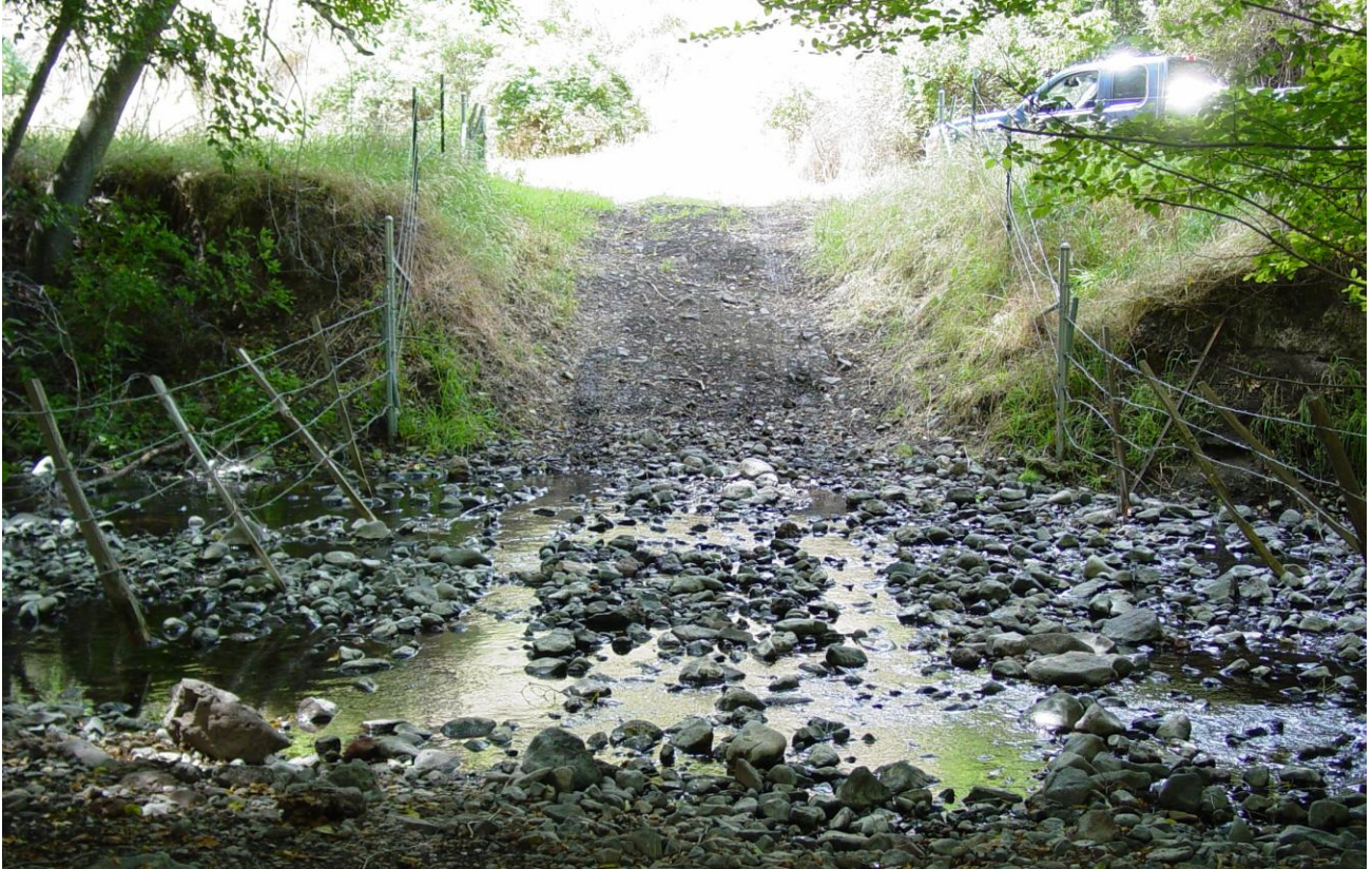
Before construction during low summer flows at ford crossing