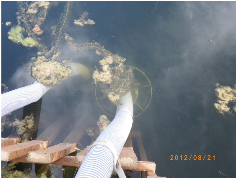
Fish screen at new point of diversion in pond for one of the irrigators.

flow through from the 3M Ditch headworks to the most downstream point of diversion, and more efficient use of on farm water resulting in increased instream flow to the confluence of the Teanaway River with the Yakima River.