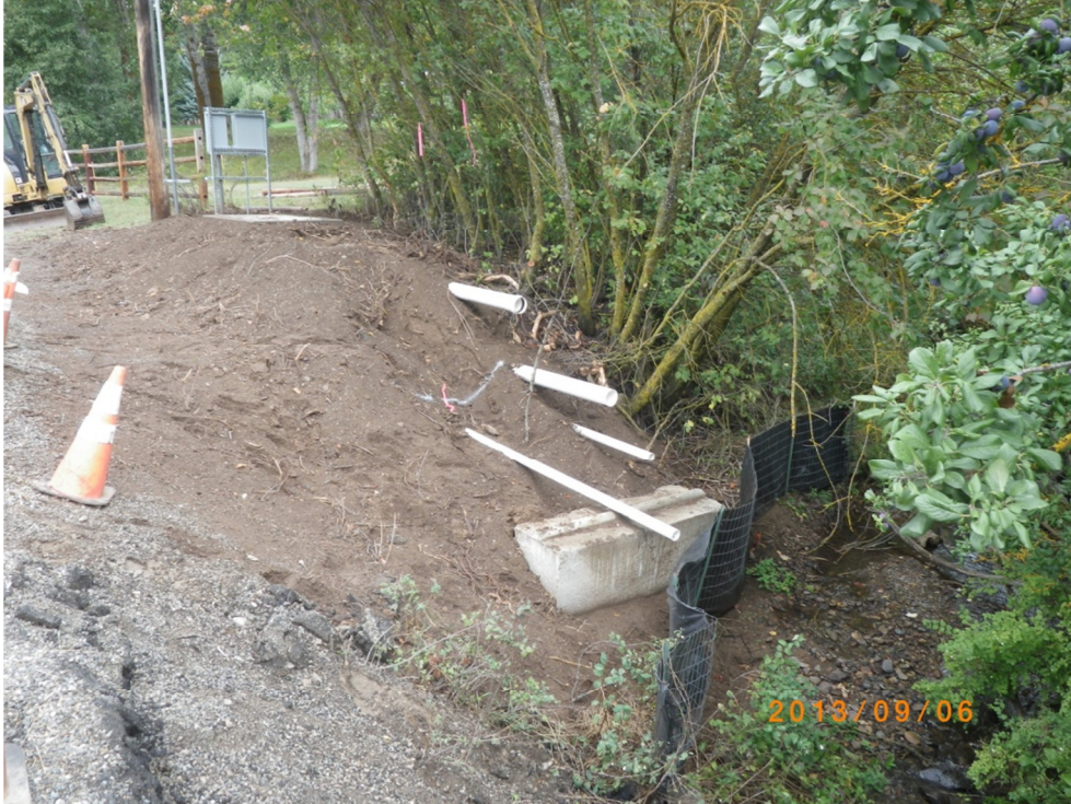
New point of diversion on Mason Ck.