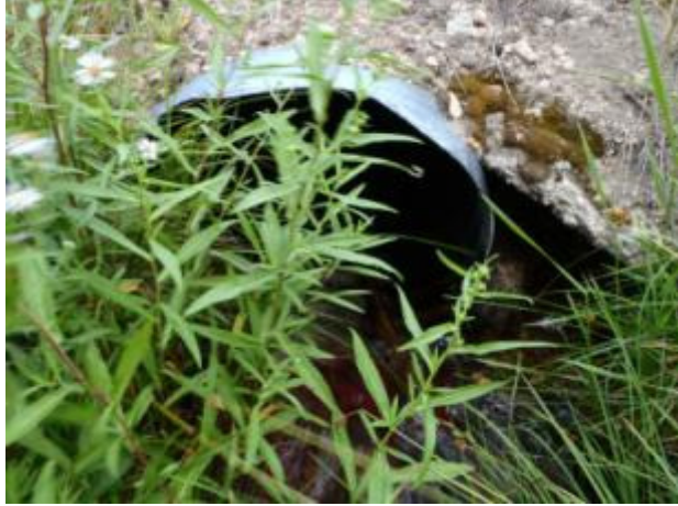
Pre-Installation: Looking Downstream at Inlet