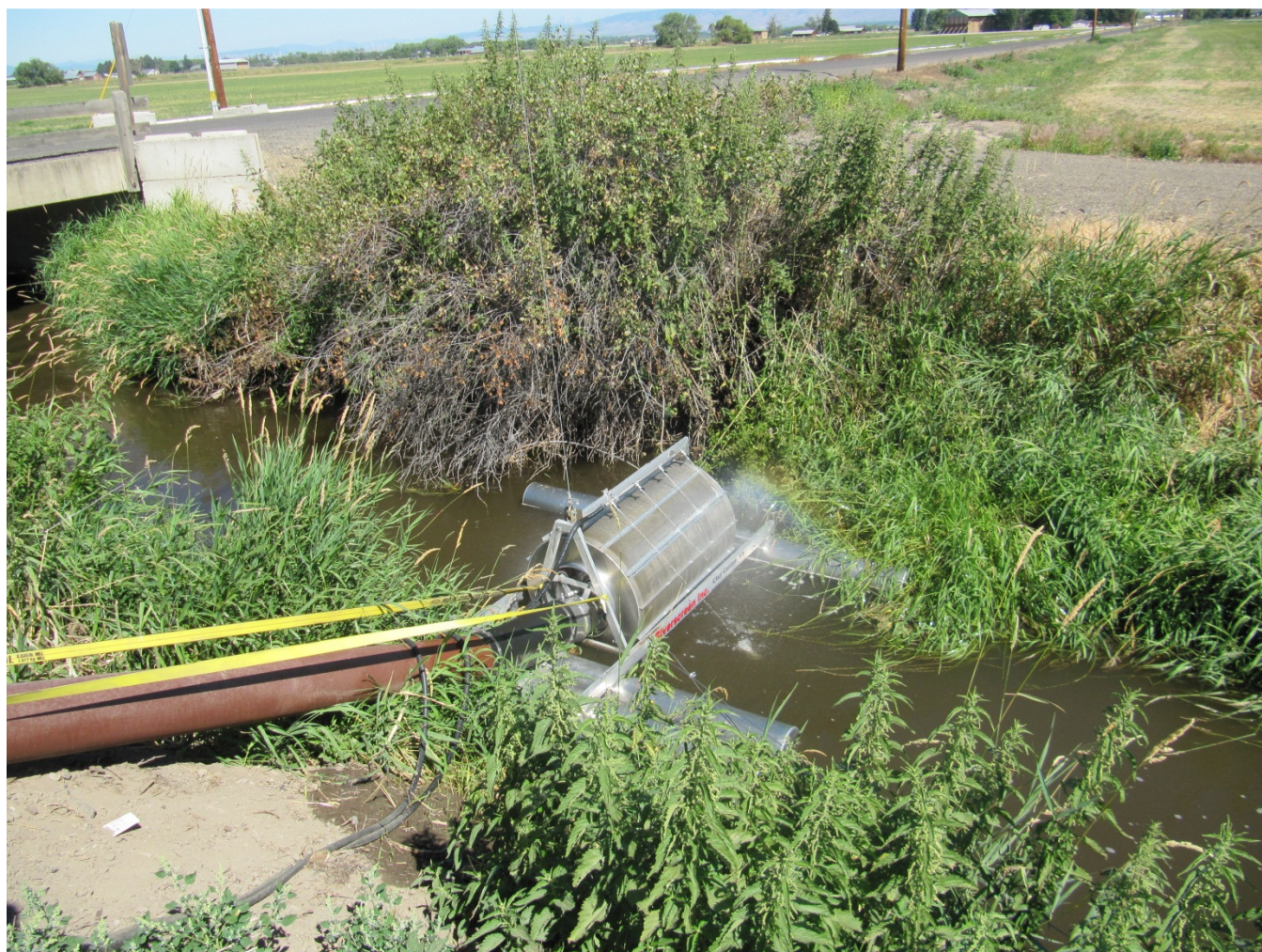
Figure 1. This is a photo of the new fish screen in operation. The photo was taken July 18, 2013.

remaining instream to benefit fish and wildlife habitat. Conversion to the sprinkler system results in less tailwater from the field entering Parke Creek, thereby improving water quality. The entire project was completed as planned and is considered a success.