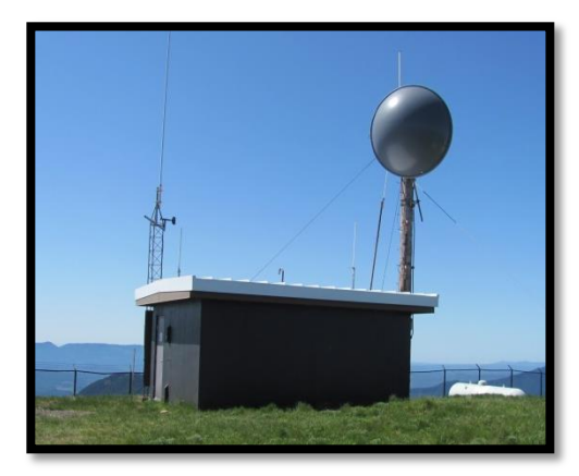
Radio communications pass between communications sites