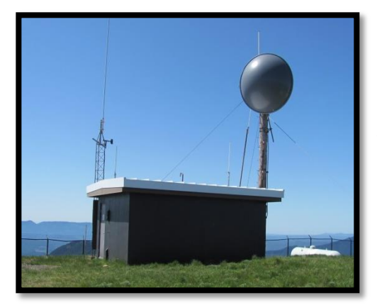
Radio communications pass between communications sites