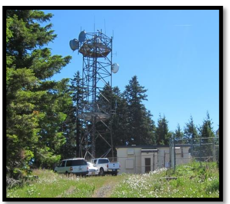
Radio communications pass between communications sites

West Point Spur Colocate at Existing Consumer's Power, Inc. Site – BPA Prospect Hill Site