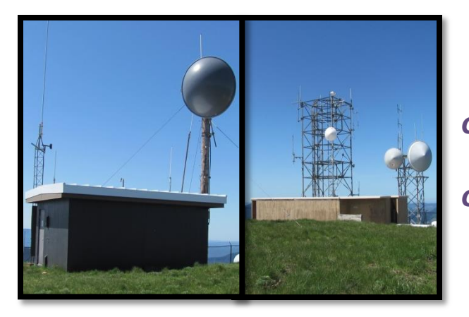
Radio communications pass between communications sites