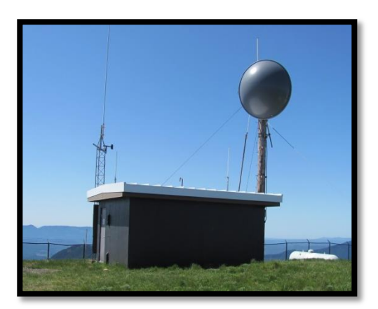
Radio communications <u>currently</u> pass between these two communications sites