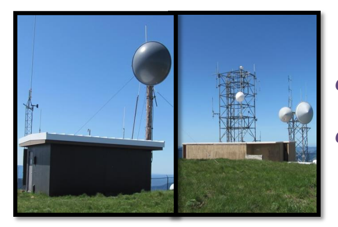
Radio communications pass between communications sites