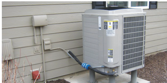
BPA's Emerging Technologies team monitored new high-efficiency variable capacity heat pumps at homes in central Oregon to learn more about their performance in the Northwest climate.

BPA's Office of Technology Innovation also plays an important role in the future of energy efficiency. Through the National Energy Efficiency Technology Roadmap,