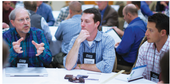
BPA and the Northwest Energy Efficiency Alliance co-host an annual conference where staff from electric utilities throughout the Northwest, as well as implementers, consultants, researchers, vendors and industry partners, share their energy efficiency experiences and learn about the latest energy-saving innovations and programs.

When BPA's utility customers purchase power from BPA they also invest in energy efficiency. A portion of the power rate goes to support BPA's regional energy efficiency program. The primary component of BPA's EE program is the suite of efficiency measures it offers to utilities. Customers can choose from a huge list of different measures that they can implement and report to BPA for reimbursement. These measures cover every sector of the economy and range from simple residential light bulbs to massive industrial motors. This variety allows BPA's customers to pick the programs that best serve their retail power customers.