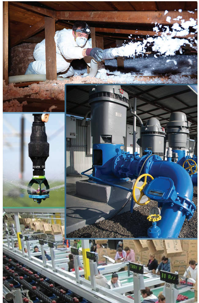
BPA partners with Northwest publicly-owned electric utilities to develop programs and incentives that encourage more efficient energy use in homes, businesses, industrial facilities and by Northwest farmers, growers and irrigators.

Why would the region's largest power marketer want to save energy? BPA's mission is to provide reliable power at low rates. Energy efficiency is the most cost-effective way to meet our customers' power demands. Plus, it complements our clean power portfolio, which includes marketing carbon-free power from 31 federal dams on